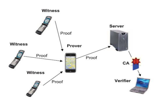
Fig. 1. Location proof updating architecture and message flow.

In APPLAUS, mobile nodes communicate with neighboring nodes through Bluetooth, and communicate with the untrusted server through the cellular network interface. Based on different roles they play in the process of location proof updating,